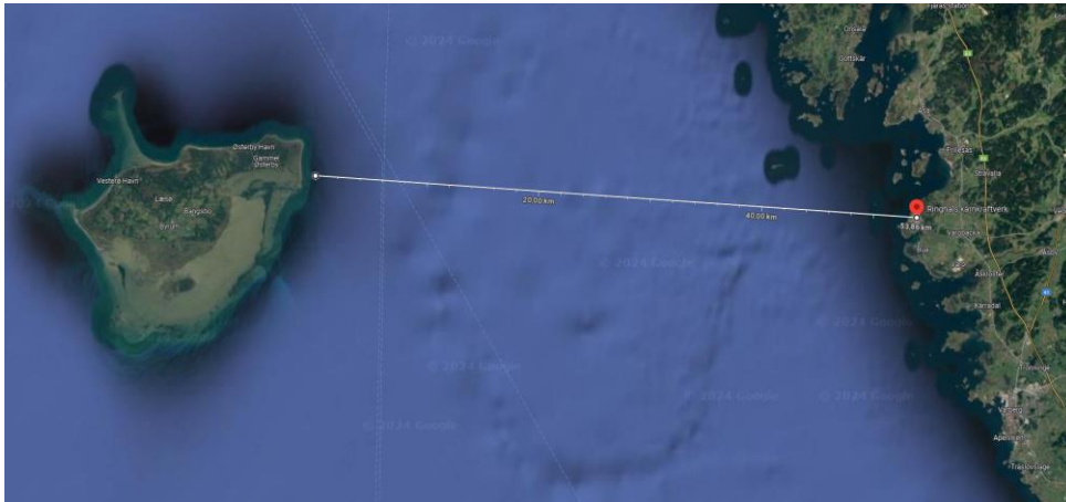
Figure 2. The map shows the distance, as the crow flies, between the Värö Peninsula and the Danish island of Läsö. The distance between Värö Peninsula and Läsö is approximately 50 km.

The design of the proposed nuclear power plant has not been fully defined, so the calculations in this report are based on a conservative, generic source term 1 . Dispersion conditions and exposure data have been selected as far as possible in relation to the Nordic circumstances. The radiation dose caused by a radioactive release is different for children and adults because the exposure pathways are different for different age categories. For example, food intake differs between these groups. To cover the variations, this report presents results for one-year-old children and adults.