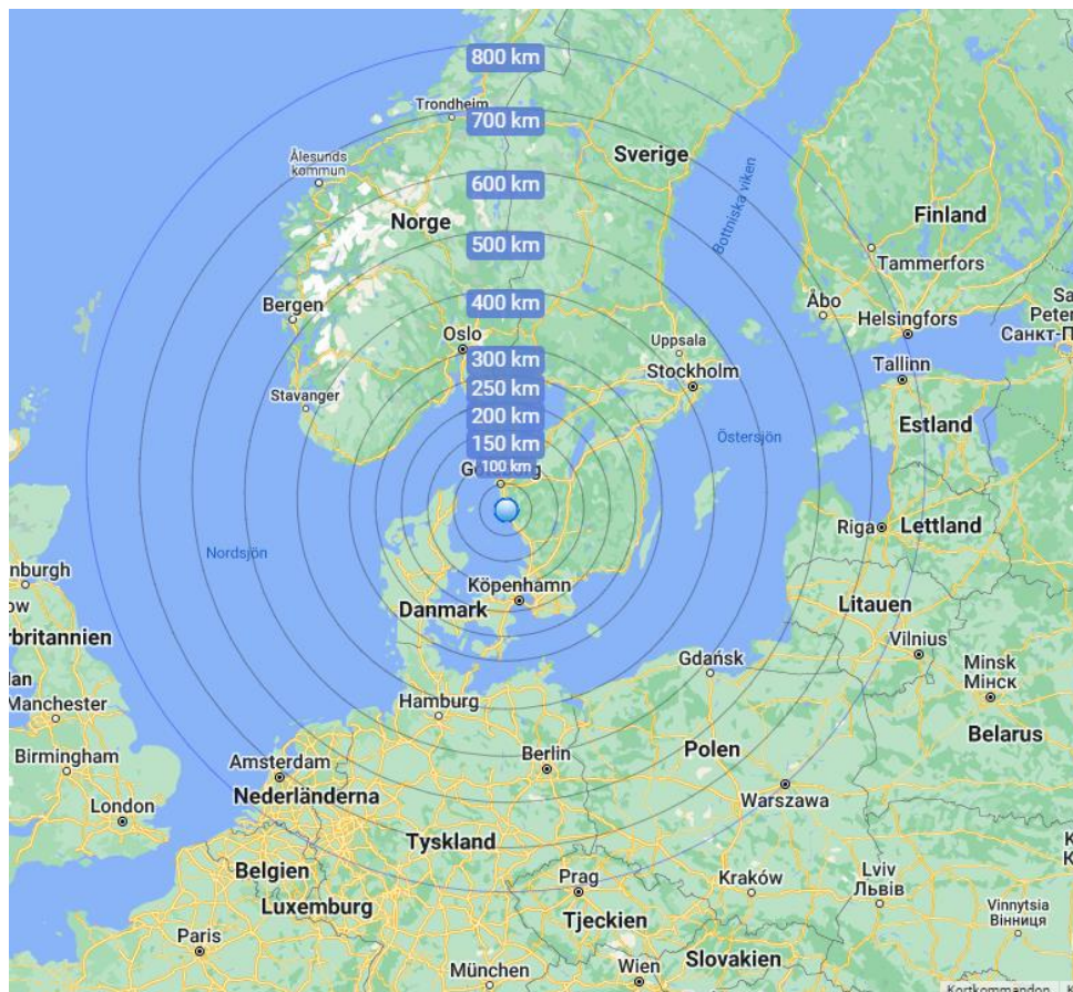
Figure 1. The land area around the site in question on the Värö Peninsula out to a radius of 800 km.

The land area considered is within a radius of up to 800 km from the site in question on the Värö Peninsula, please see Figure 1.